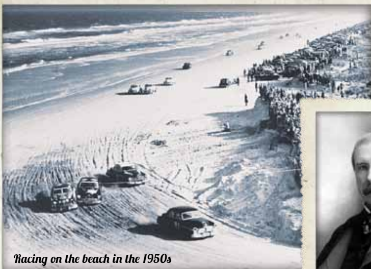
Racing on the beach in the 1950s