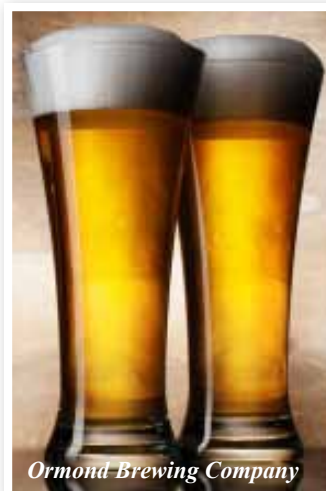
Ormond Brewing Company

Fall is the perfect time of year to try out some tasty, new microbreweries and taphouses in the area. We've got the perfect pairings for some of your favorite foods, and our creative juices are definitely flowing!