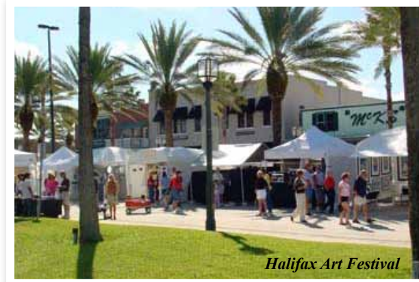
Halifax Art Festival

53rd Annual Halifax Art Festival, Nov. 7-8. Set in historic downtown Daytona Beach on the scenic Halifax River, this two-day professionally juried and judged art show attracts more than 200 artists from throughout the United States. It also features music, food, entertainment and special activities for children. HalifaxArtFestival.com