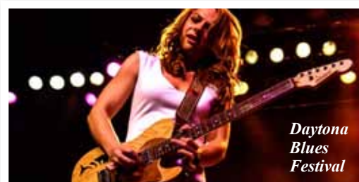
Daytona Blues Festival

Riverfront Food & Wine Walk, Sept. 19. Taste award-winning wines and delicious specialties from local restaurants and vendors while strolling through the beautiful Riverfront Shops on historic Beach Street downtown in Daytona Beach, 1 to 6 p.m. Live music, local art, give-a-ways and a special gift will be given to the first 50 ticketed guests that arrive! RiverfrontShopsOfDaytona.com