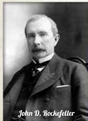
John D. Rockefeller

Daytona Beach has a tale that's been in the works for centuries. From the Timucuan Indians to auto racing on the beach, from the home of millionaire philanthropist John D. Rockefeller to the art collection of Cuban leader Batista – the story continues to be written, and the destination awaits your arrival. Your trail of exploration possibilities is rich here, and its paths lead to scenic wooded preserves, pristine waterways, and well, ale!