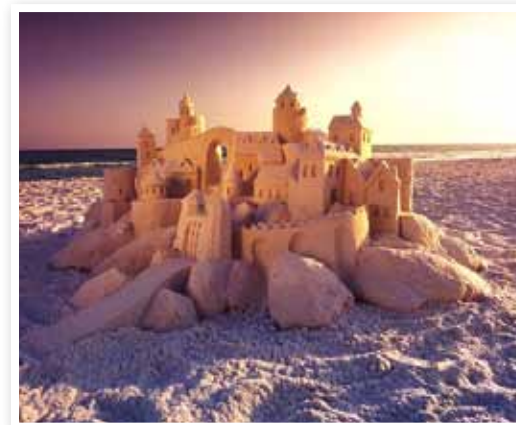
CHART YOUR COURSE: ARTS, CULTURE & HERITAGE

pool, 7 restaurants and lounges, gift shop, and the Spa at the Hilton. The Hilton is adjacent to Daytona Lagoon Waterpark and connected to the Ocean Walk Shoppes and Movies. Our Sun&Fun rate is available through December 31, 2015 with rates as low as $105 per night. Special packages are available throughout the year to include Romance, Family Fun, the Spa and many more. Check out our Heroes rate offered to all first responders and retired or active military and their families. www.daytonahilton.com/specials-packages or call 866-536-8477.