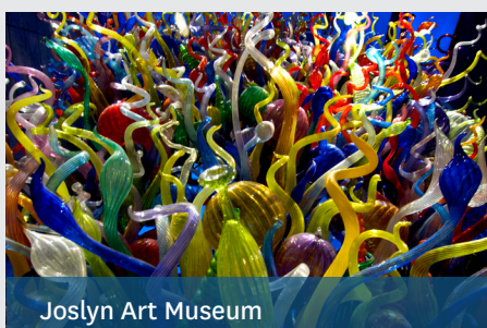
Joslyn Art Museum

TD Ameritrade Park Omaha is a $126 million stadium that features 24,000 seats, 26 suites and an expansive Fan Fest area. The home of the NCAA Men's College World Series is within walking distance of CenturyLink Center Omaha, the Bob Kerrey Pedestrian Bridge and the Old Market entertainment district.