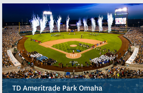
TD Ameritrade Park Omaha