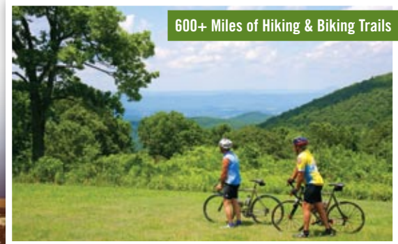
600+ Miles of Hiking & Biking Trails