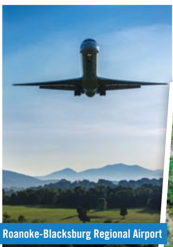
Roanoke-Blacksburg Regional Airport