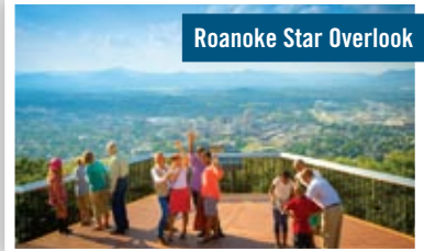
Roanoke Star Overlook

➤ Endless Supply of Things to Do , including National Attractions