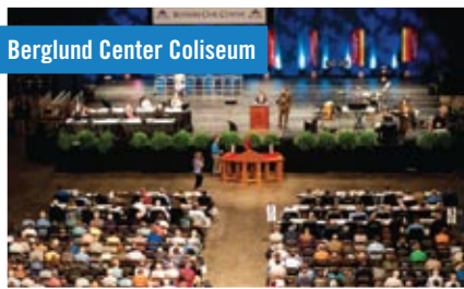
Berglund Center Coliseum

Roanoke was voted the “2013 Southern Hospitality City” in Virginia.