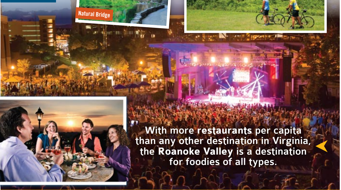
Elmwood Park Concert