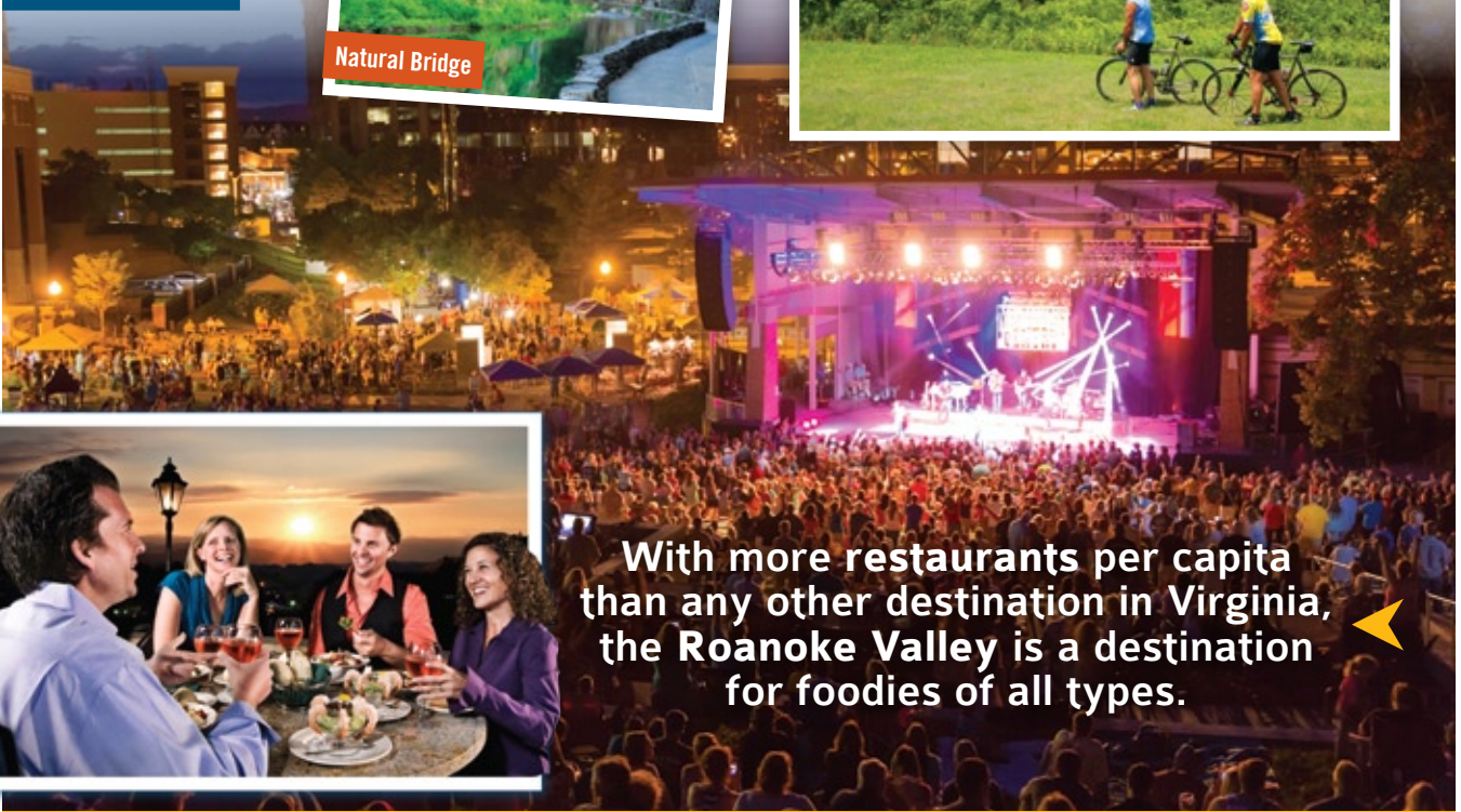
Elmwood Park Concert