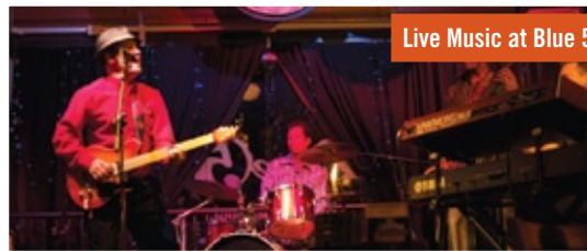
Live Music at Blue 5