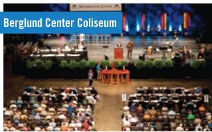
Berglund Center Coliseum

Roanoke was voted the “2013 Southern Hospitality City” in Virginia.