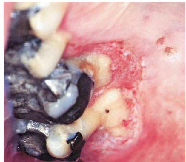
FIGURE 6. A view of the sequestered bone in the right side of the palate.

During the following 3 to 4 months, the patient improved in several locations. The facial paralysis was completely resolved. Permanent loss of mandibular nerve function was obvious by the total absence of activity in the inferior alveolar and mental nerve. The rest of the trigeminal nerve paresthesia was recovered. Paralysis of the lateral pterygoid muscle suddenly disappeared after 3 months, making it