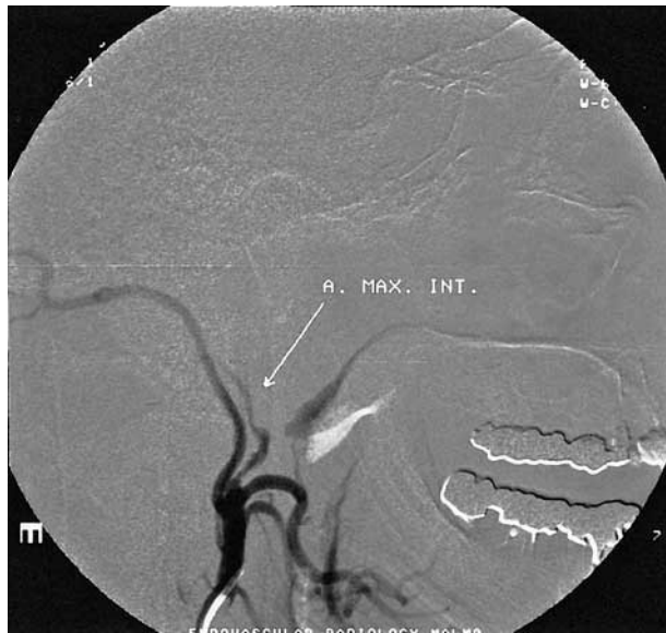
FIGURE 1. Angiogram showing no blood flow in the right maxillary artery.

be an indication of apical perforation. After completion of the instrumentation, the application of an absorbent paper point produced new profuse bleeding from the distal canal. Two mesial canals were dressed with calcium hydroxide paste (Calasept; Nordiska Dental, Ängelholm, Sweden). The bleeding from the distal canal stopped, and calcium hydroxide paste was then applied. When the paste was applied with a syringe in the distal canal, the patient experienced severe local pain. In about 1 or 2 minutes, the corresponding half of the face became pale. During the following 90 minutes, the right half of the face, including the ear, became increasingly cyanotic in combination with increasing pain. Part of the palate, corresponding to the right greater palatine foramen, also became cyanotic. Facial nerve paralysis and trigeminal paresthesia developed in all branches of the right side. Vision in the right eye became blurry. During the progression of symptoms, the patient was admitted to the emergency department of the university hospital, where an ear, nose, and throat specialist, a plastic surgeon, and a maxillofacial surgeon examined the patient. A magnetic