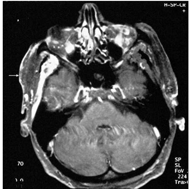
FIGURE 4. Magnetic resonance image showing edema (arrow) in the right temporal muscle demarcated by a hyperemic zone.

resonance imaging examination was started but could not be completed because of claustrophobia.