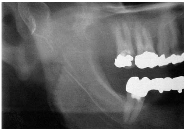
FIGURE 2. Part of a panoramic radiograph showing the radiopaque calcium hydroxide in the inferior alveolar artery.

be an indication of apical perforation. After completion of the instrumentation, the application of an absorbent paper point produced new profuse bleeding from the distal canal. Two mesial canals were dressed with calcium hydroxide paste (Calasept; Nordiska Dental, Ängelholm, Sweden). The bleeding from the distal canal stopped, and calcium hydroxide paste was then applied. When the paste was applied with a syringe in the distal canal, the patient experienced severe local pain. In about 1 or 2 minutes, the corresponding half of the face became pale. During the following 90 minutes, the right half of the face, including the ear, became increasingly cyanotic in combination with increasing pain. Part of the palate, corresponding to the right greater palatine foramen, also became cyanotic. Facial nerve paralysis and trigeminal paresthesia developed in all branches of the right side. Vision in the right eye became blurry. During the progression of symptoms, the patient was admitted to the emergency department of the university hospital, where an ear, nose, and throat specialist, a plastic surgeon, and a maxillofacial surgeon examined the patient. A magnetic