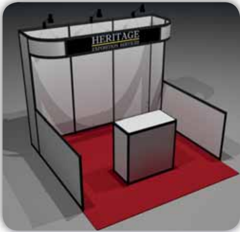
MD01 Modular Hardwall Display Package 1