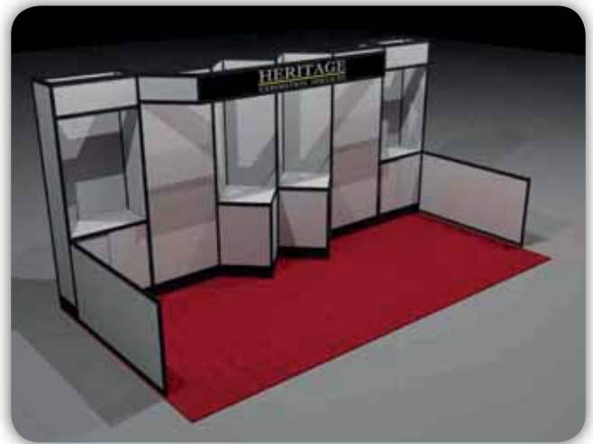
MD04 Modular Hardwall Display Package 4