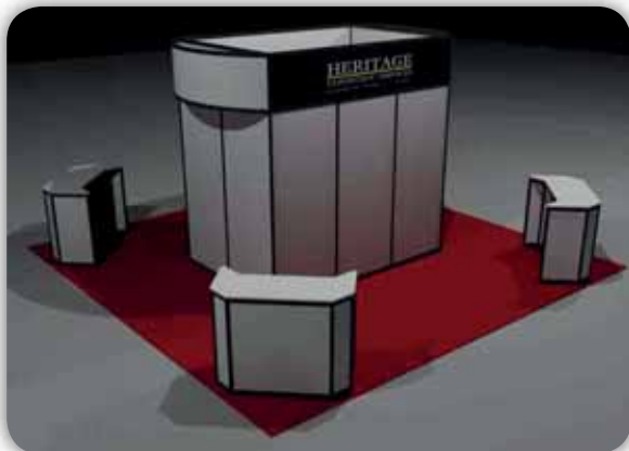
MD05 Modular Hardwall Display Package 5