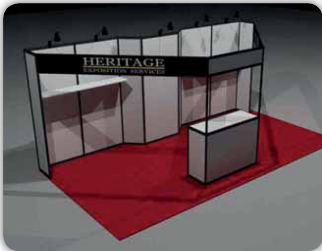
MD03 Modular Hardwall Display Package 3