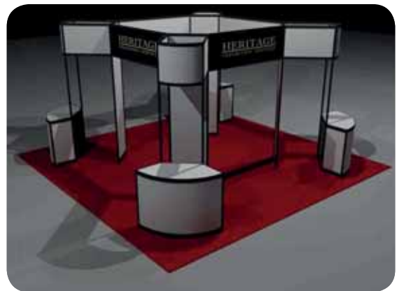
MD06 Modular Hardwall Display Package 6