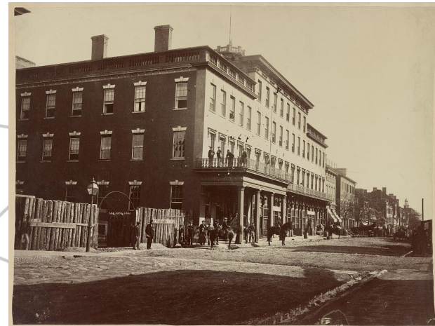
The real hospital in Alexandria