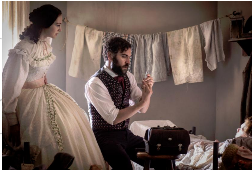
MERCY STREET Premieres Sunday, January 17 on PBS

More than 30 buildings were taken over as hospitals.