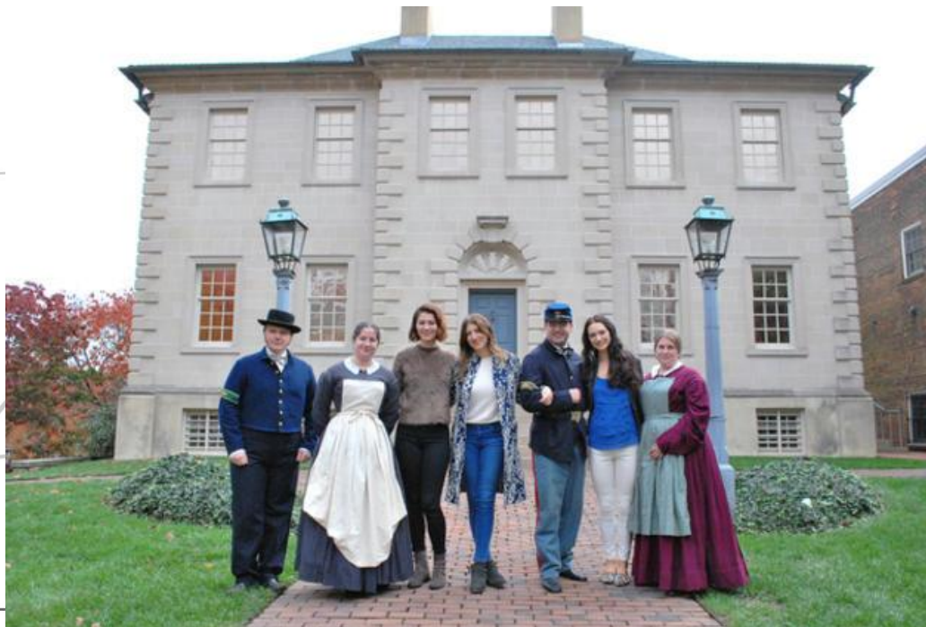
Exhibit Who These Wounded Are: The Extraordinary Stories of the Mansion House Hospital