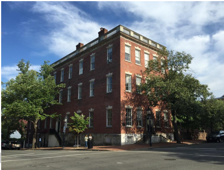
133 N. Fairfax St. today