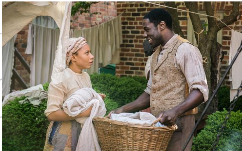
MERCY STREET Premieres Sunday, January 17 on PBS

African Americans claiming their freedom