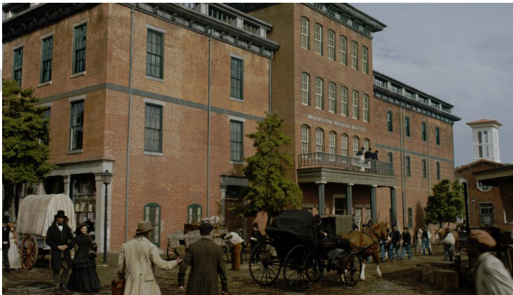
Mercy Street set

The two collide at Mansion House Hospital , which was the Green family's luxury hotel that has been taken over and transformed into a Union Army Hospital.