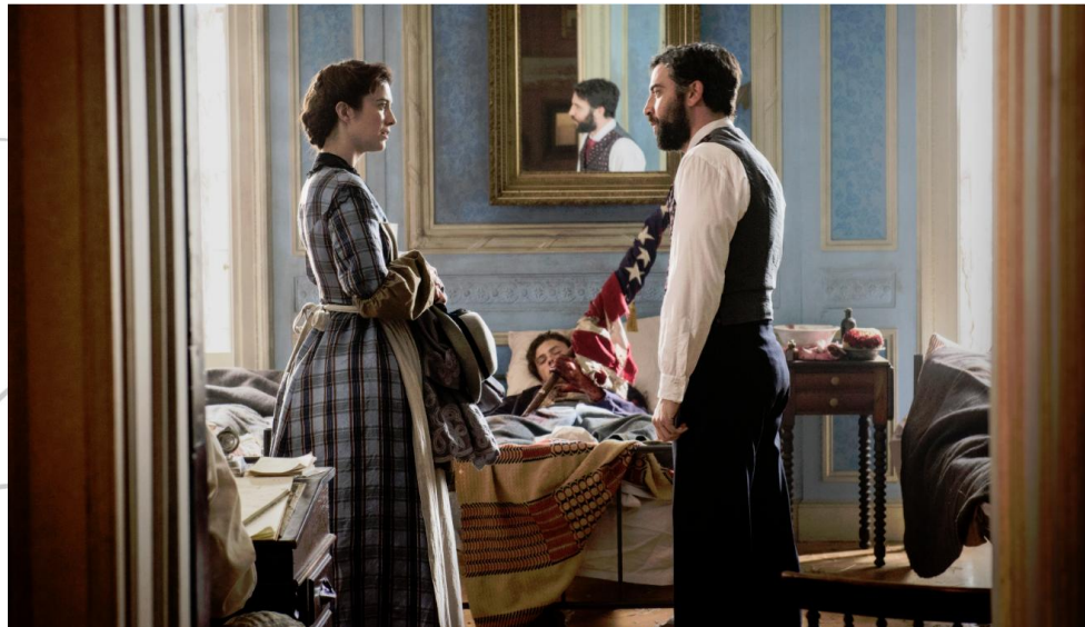
MERCY STREET Premieres Sunday, January 17 on PBS

To capitalize on Mercy Street, Alexandria presents more than two dozen new visitor experiences in 2016