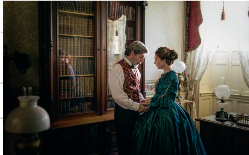
MERCY STREET Premieres Sunday, January 17 on PBS