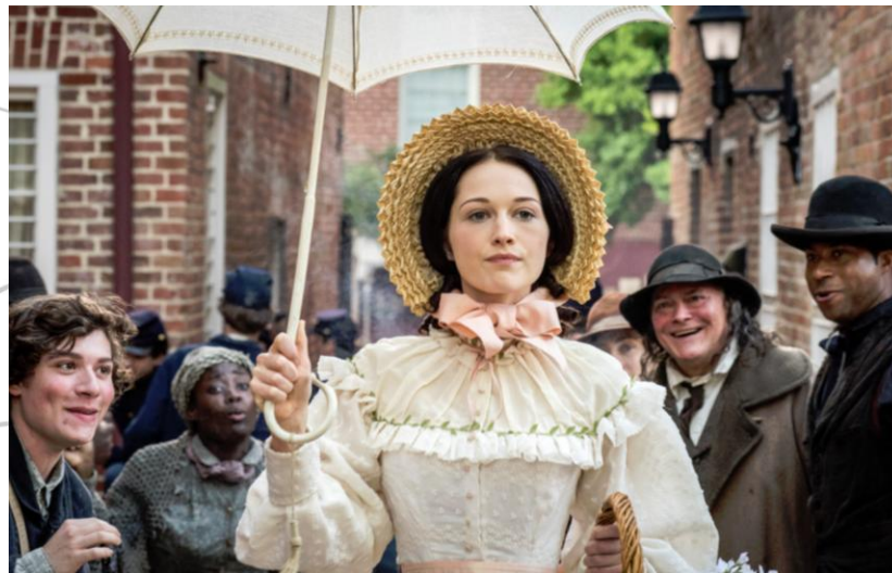
MERCY STREET Premieres Sunday, January 17 on PBS

PBS' first American drama in ten years is inspired by real events in Civil War Alexandria, Virginia.