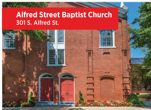
Alfred Street Baptist Church 301 S. Alfred St.