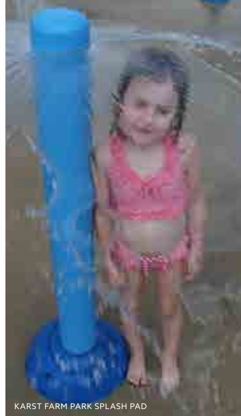
KARST FARM PARK SPLASH PAD

See lake listings for directions Monroe Lake: Paynetown SRA, Fairfax SRA and Hardin Ridge Recreation Area Lake Lemon: Riddle Point Park