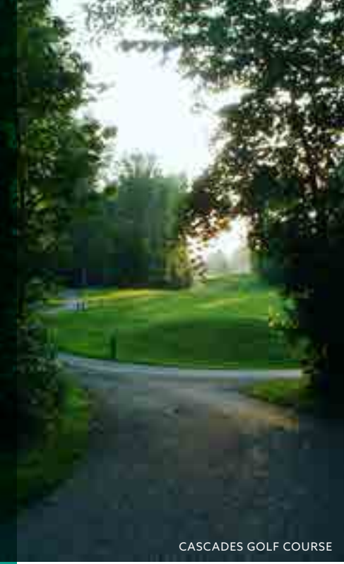
CASCADES GOLF COURSE