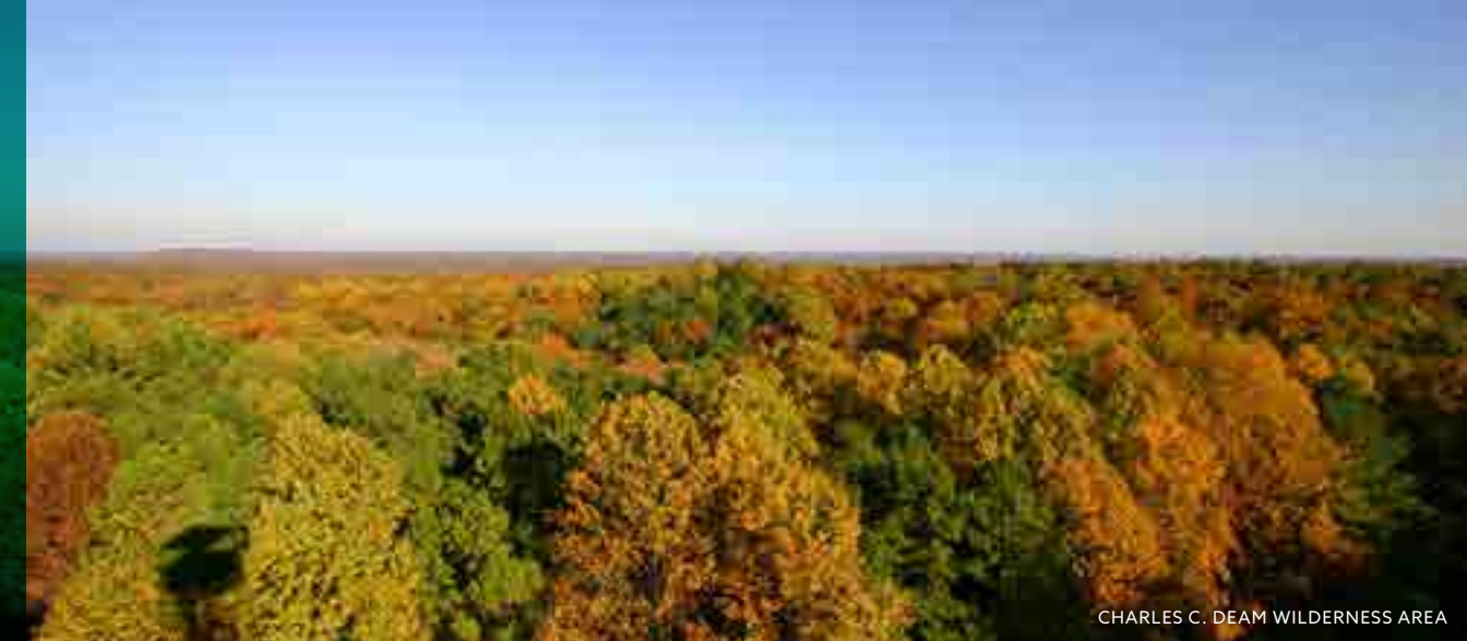
CHARLES C. DEAM WILDERNESS AREA