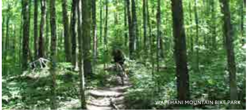
WAPEHANI MOUNTAIN BIKE PARK

Features a 133-acre lake, fishing, hiking, camping, and hunting. 772 Yellowwood Lake Rd.; 812-988-7945; in.gov/dnr