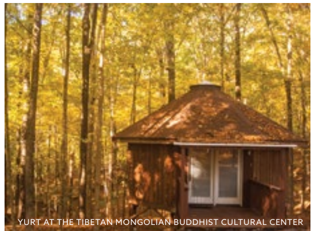
YURT AT THE TIBETAN MONGOLIAN BUDDHIST CULTURAL CENTER