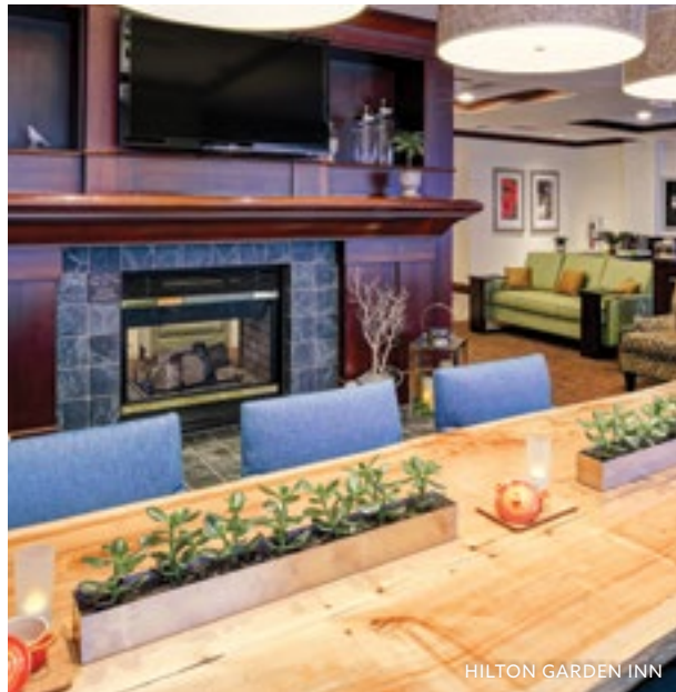
HILTON GARDEN INN

If you need to stay overnight in Bloomington (and you should, even if it's just so you can have breakfast at one of the amazing restaurants here), you can find the right type of lodging option to fit your style and your budget. From familiar brands to unique bed and breakfasts, you'll find comfortable accommodations in every region of the city. And if you need help figuring it all out, call the Bloomington Visitors Center to get recommendations and availability updates at 800-800-0037.