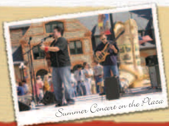
Summer Concert on the Plaza

NUMBERS CORRESPOND TO THE MAP ON BACK. AUDIO TOURS ARE FREE, BUT YOUR INDIVIDUAL CELL PLAN CHARGES MAY APPLY.