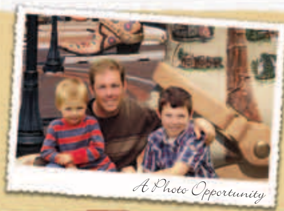
A Photo Opportunity