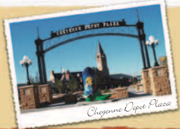
Cheyenne Depot Plaza