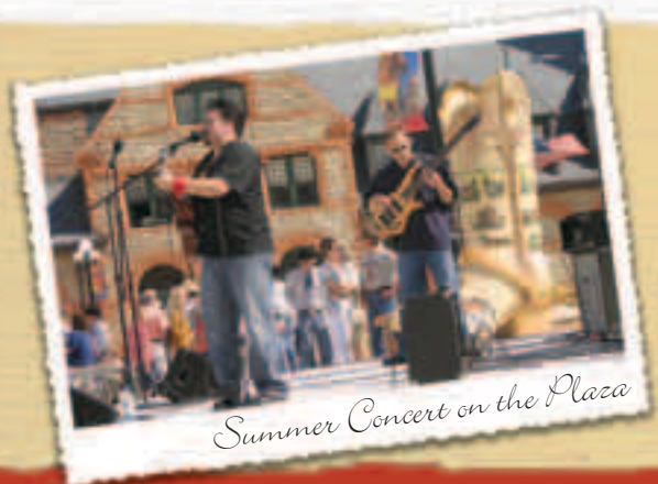
Summer Concert on the Plaza

NUMBERS CORRESPOND TO THE MAP ON BACK. AUDIO TOURS ARE FREE, BUT YOUR INDIVIDUAL CELL PLAN CHARGES MAY APPLY.