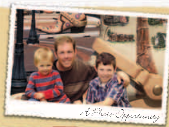
A Photo Opportunity