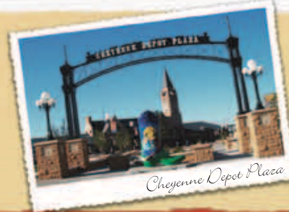
Cheyenne Depot Plaza