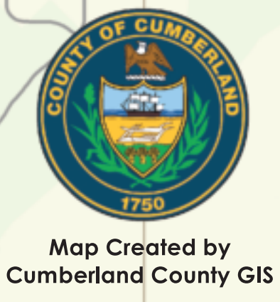
Map Created by Cumberland County GIS