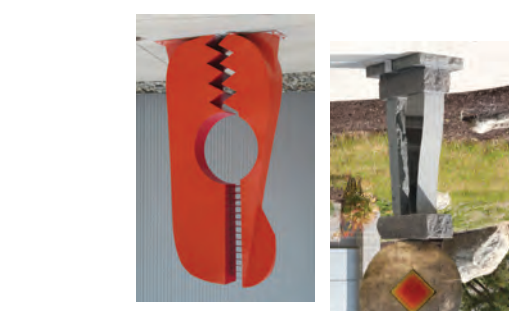
CLOCKWISE FROM TOP RIGHT: