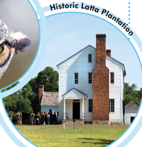
Historic Latta Plantation