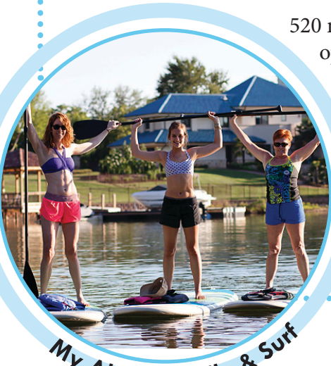
My Aloha Paddle & Surf

520 miles of shoreline, 3 power plants, and 32,510 acres of recreation make for plenty of opportunities to explore the waters of Lake Norman. Lake activities can mean a variety of things from wakeboarding , rowing , to fishing and sailing . It's a water sports paradise. With so many acres and miles of shoreline, the best way to explore the lake is by boat. Several marinas grace the shores of Lake Norman, providing boat rentals and launches. Boats and pontoons share the waters with kayaks , canoes , paddle boards , the occasional paddle boat and of course, swimmers . Catch the new stand up paddle boarding craze at My Aloha Paddle Paddle & Surf and stop by the new public swimming beach for a quick dip at Ramsey Creek Park in 2016.