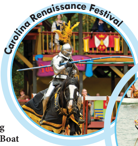
Carolina Renaissance Festival

Being located in the heart of NASCAR country, Lake Norman is the perfect pit-stop for a race shop tour. Browse the pristine facilities of a racing and football legend at Joe Gibbs Racing and discover his race shop, providing behind the scenes access to race fans.