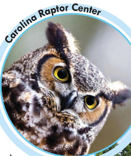
Carolina Raptor Center

Explore nature's wonders and experience history at Latta Plantation Nature Preserve . The 1,400 acre preserve boasts 16 miles of trails for hiking , segway tours , and horseback riding . Get face to face with birds of prey at the Carolina Raptor Center , which houses one of the world's largest raptor collections. Don't miss the live flight shows , Harry Potter Owl Exhibit , Bald Eagles: Savannah and Derek , and a world of Vulture Culture . Then step back into the past at Historic Latta Plantation , a circa 1800 cotton plantation and living history farm with historical tours , ghost hunts , and annual reenactments of battles from the Revolutionary War, Civil War and World War II.