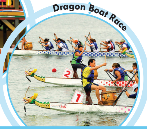
Dragon Boat Race

Lake Norman hosts many unique annual events that are sure to please. Some of our favorites include the Carolina Renaissance Festival , Rural Hill Scottish Festival and Loch Norman Highland Games , Amazing Maize Maze , Lake Norman Beerfest , Annual Lighted Boat Parade , North Carolina Brewers and Music Festival , and the international Charlotte Asian Festival & Dragon Boat Race .