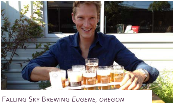
FALLING SKY BREWING EUGENE, OREGON