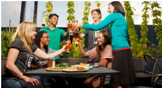
HOP VALLEY BREWING EUGENE, OREGON