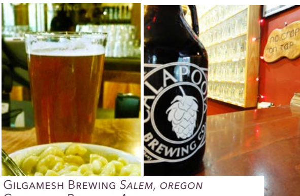
GILGAMESH BREWING SALEM, OREGON CALAPOOIA BREWING ALBANY, OREGON