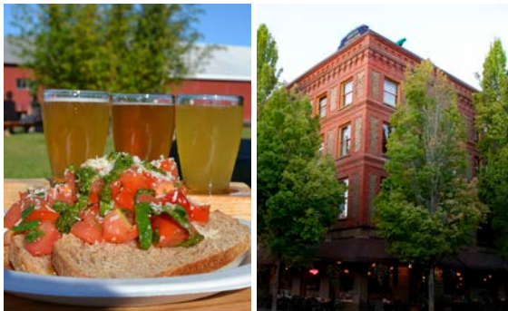
AGRARIAN ALES COBURG, OREGON HOTEL OREGON MCMINNVILLE, OREGON