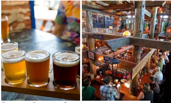
BLOCK 15 BREWING CORVALLIS, OREGON OLD CHURCH & PUB WILSONVILLE, OREGON

Known for having more breweries per capita than any other state, Oregon is at the forefront of the craft beer revolution. Discover Oregon's beer culture when you taste your way through the Willamette Valley's artisan breweries on the Valley BeerVana Trip.