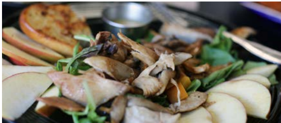
BLOCK 15 BREWPUB CORVALLIS, OREGON