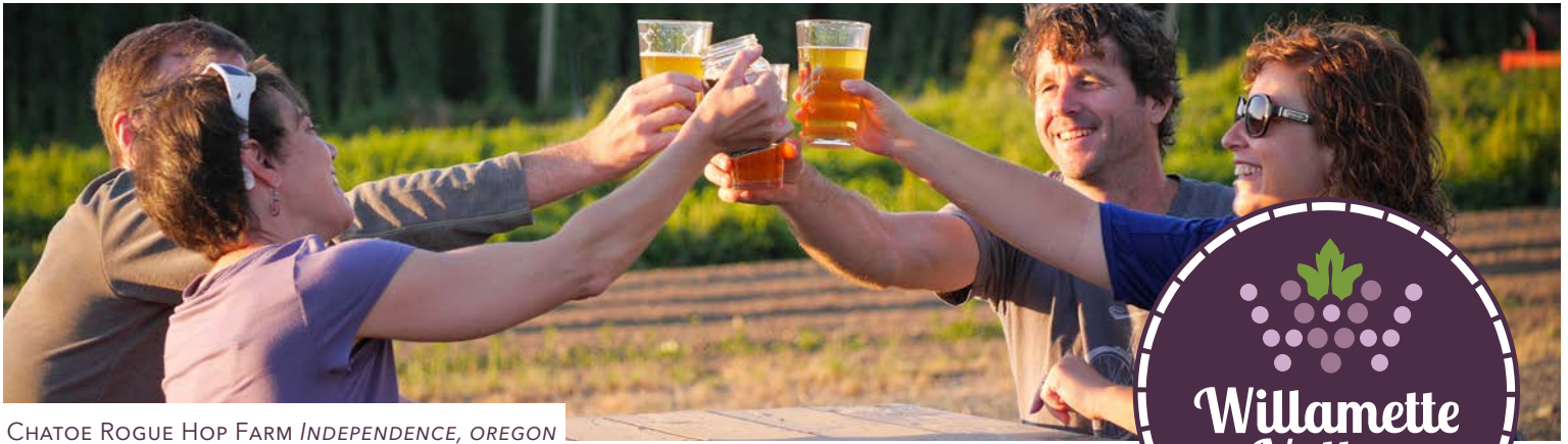
CHATOE ROGUE HOP FARM INDEPENDENCE, OREGON