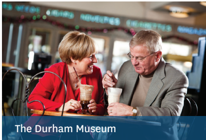
The Durham Museum