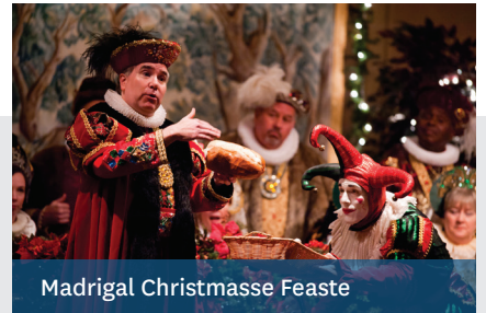
Madrigal Christmase Feaste