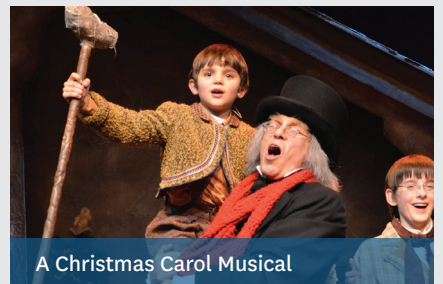
A Christmas Carol Musical