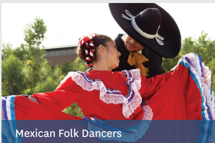
Mexican Folk Dancers