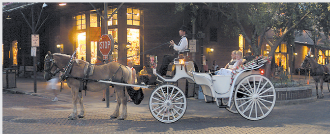
Omaha’s Old Market District

Contact: Bill Slovinski bslovinski@visitomaha.com (402) 444-1760