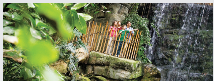
Omaha’s Henry Doorly Zoo & Aquarium