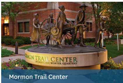
Mormon Trail Center