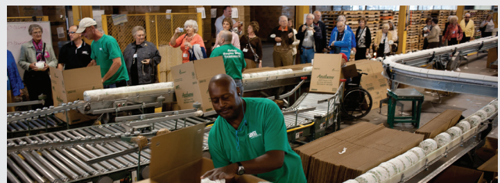
Toilet Paper Factory