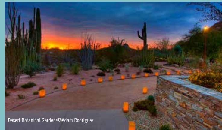
Desert Botanical Garden/©Adam Rodriguez

Other popular shopping destinations in Greater Phoenix include Westgate Entertainment District (Glendale) [ 22 L-10 ] , Chandler Fashion Center [ 23 V-20 ] , Tempe Marketplace [ 24 P-19 ] , Desert Ridge Marketplace [ 25 G-17 ] and Scottsdale Quarter [ 26 I-18 ] .