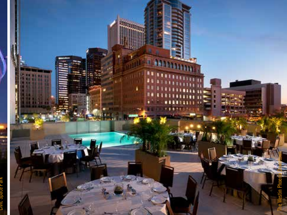
The Westin Phoenix Downtown