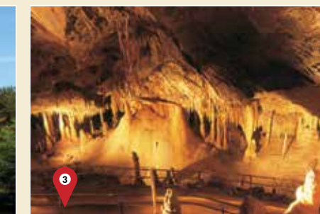
Kartchner Caverns State Park