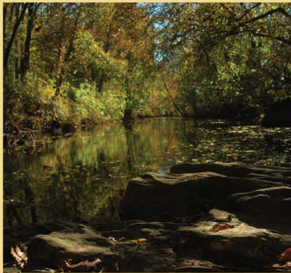
Lynch Park Landing on Pigg River

Welcome to Franklin County, the eastern gateway to The Crooked Road, a journey through Southwest Virginia's musical heritage that winds through the Appalachian Mountains for 265 miles. Franklin County has always been a cultural crossroads where black and white musicians shared ideas and learned from each other. The music they created is kept alive in frequent jam sessions and concerts. The Community and Hospitality Center in Rocky Mount will help you find them, as well as historic and outdoor recreation opportunities.