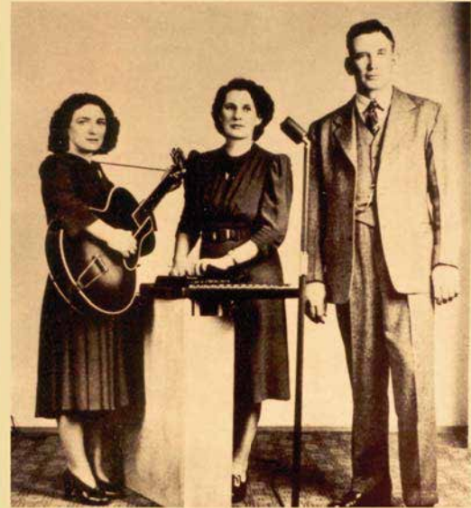
The Carter Family

The Crooked Road winds through the ruggedly beautiful Appalachian Mountains and leads you to the major hotspots of old time mountain music, country music, and bluegrass. Alive and kickin' for today's fans, these venues preserve and celebrate musical traditions passed down through generations. Annual festivals, weekly concerts, radio shows, and jam sessions ring out to large audiences and intimate gatherings. Please visit the Crooked Road website to plan your trip to coincide with the current entertainment events.