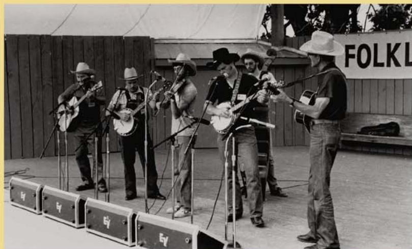
Dry Hill Draggers

The farmstead (now a National Monument) where a great American, Booker T. Washington, was born a slave is located here and the colonial wagon road to Carolina and the West can be seen here. Ferrum College is home to the Blue Ridge Institute and Farm Museum, an important Virginia institution dedicated to the craft and music traditions of Virginia. Smith Mountain Lake, Bald Knob, and the hiking trails and blueways of Franklin County allow visitors to experience the natural beauty of the Blue Ridge.