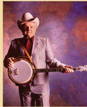
Dr. Ralph Stanley