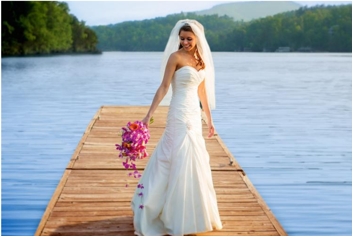
Rumbling Bald Resort

At Rumbling Bald Resort , guests join the bride outside at a gazebo facing lovely Lake Lure and later, everyone dances at the Lakeview Terrace. The open-air Beach Pavilion is more casual, located next to a trout stream. Wedding parties can be accommodated at villas, private homes or condos, and brides love the indulgent spa and make-up sessions available on-site.