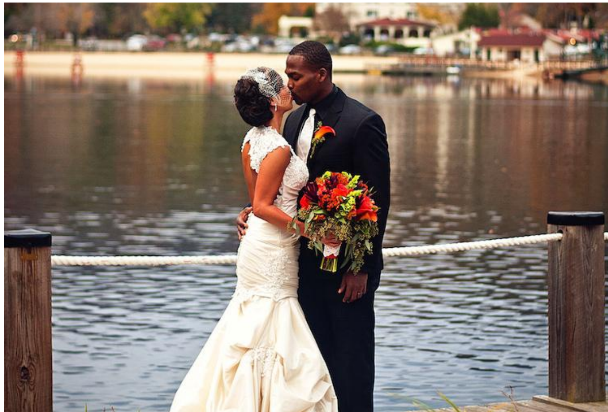
Lake Lure Inn

Gardens, the Lakeside Gazebo, and the Roosevelt Room where scenes from “Dirty Dancing” were filmed, are all elegant options. Enjoy welcome party bonfires, bridal spa packages and the trolley and carriage service.