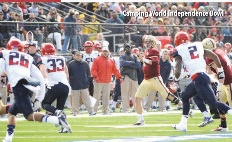
Camping World Independence Bowl