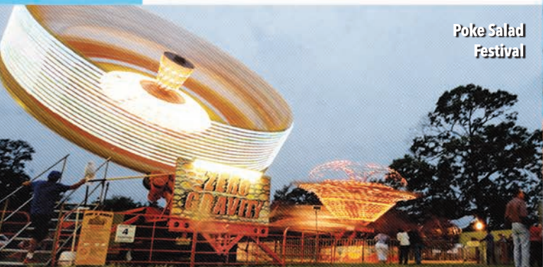
Poke Salad Festival

318-309-2647 | www.pokesaladfestival.com