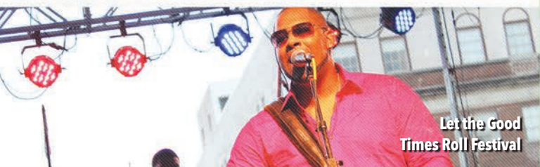
Let the Good Times Roll Festival