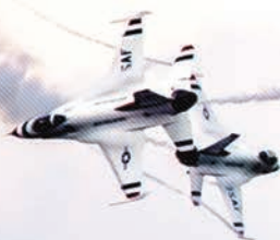
Barksdale Air Force Base Airshow

318-456-1015 | www.barksdaleafbairshow.com