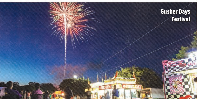
Gusher Days Festival