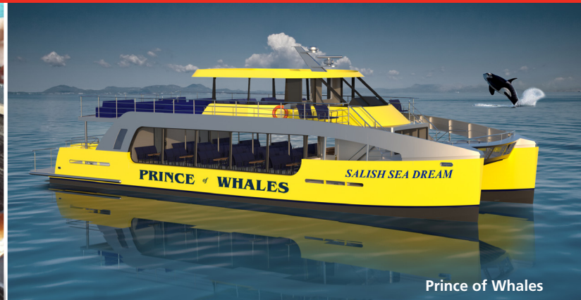
Prince of Whales