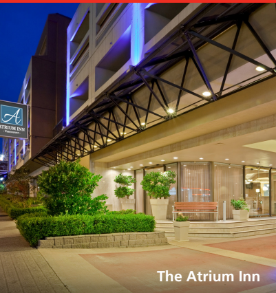
The Atrium Inn