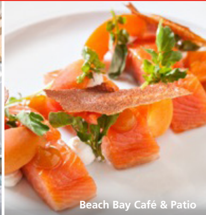
Beach Bay Café & Patio