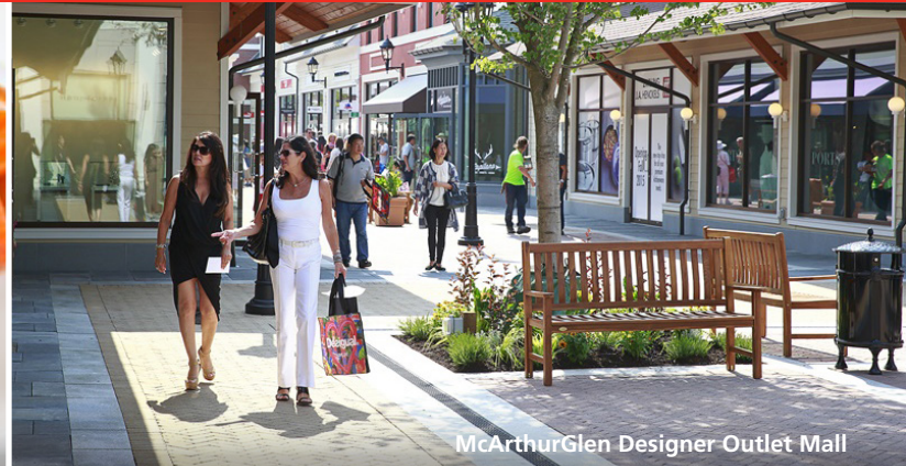
McArthurGlen Designer Outlet Mall