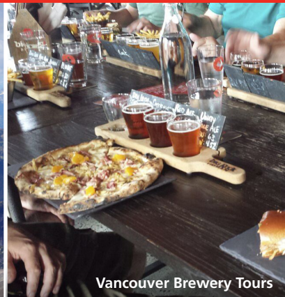
Vancouver Brewery Tours