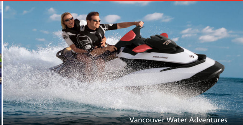
Vancouver Water Adventures