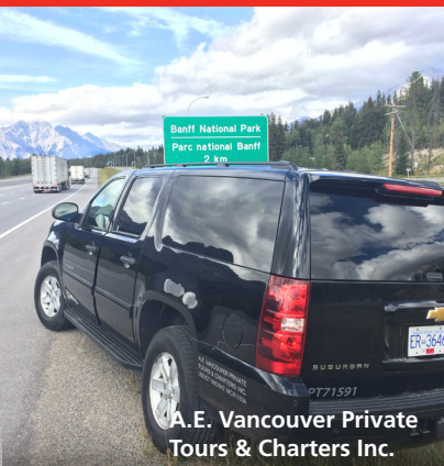
A.E. Vancouver Private Tours & Charters Inc.