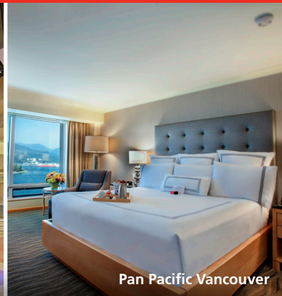
Pan Pacific Vancouver