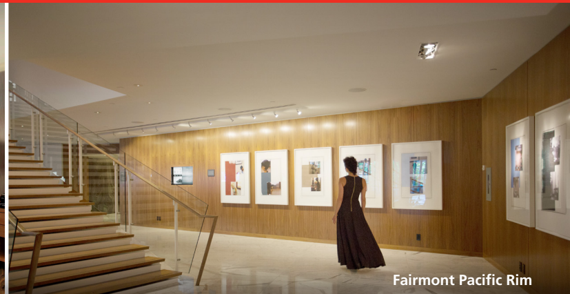
Fairmont Pacific Rim