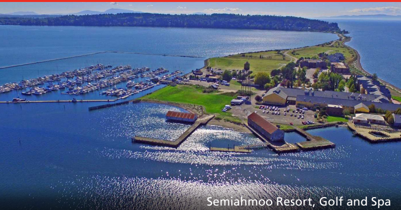
Semiahmoo Resort, Golf and Spa