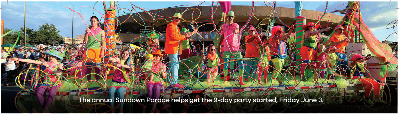
The annual Sundown Parade helps get the 9-day party started, Friday June 3.