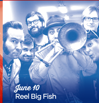
June 10 Reel Big Fish