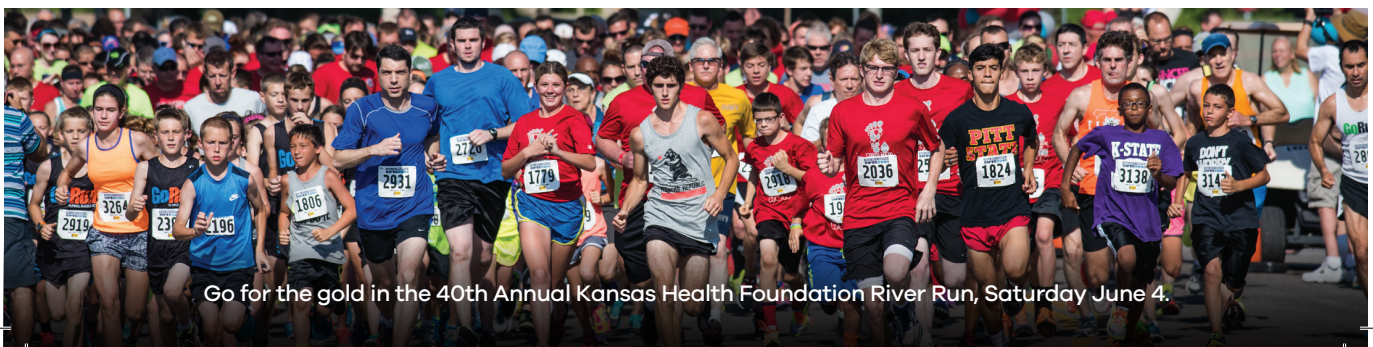
Go for the gold in the 40th Annual Kansas Health Foundation River Run, Saturday June 4.

For the full list of concerts and events head to VisitWichita.com !