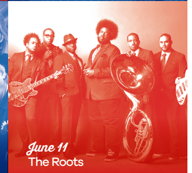
June 11 The Roots

Party in the ICT at the 2016 Riverfest! Nine days of music, food, and fun await you at the largest and longest-running festival in Kansas! To see all of the events and plan your Riverfest getaway, head to VisitWichita.com !