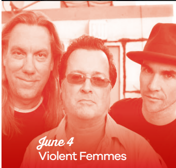
June 4 Violent Femmes