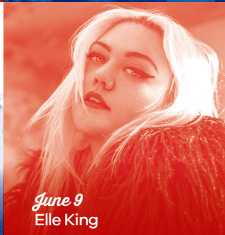
June 9 Elle King