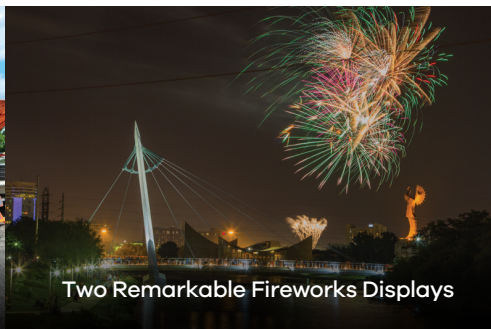
Two Remarkable Fireworks Displays