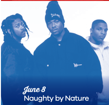
June 8 Naughty by Nature