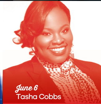
June 6 Tasha Cobbs