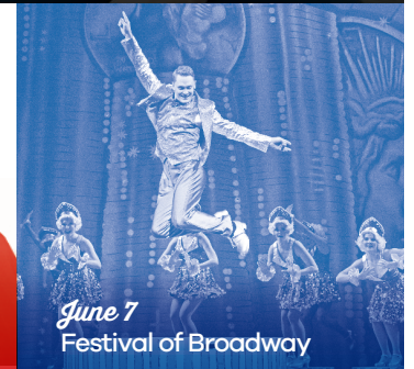
June 7 Festival of Broadway